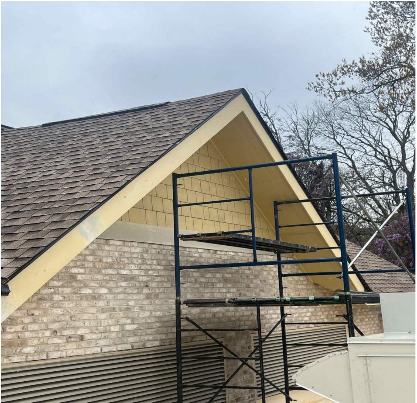
Continued Hardie Shingle Siding at the TPO Roof