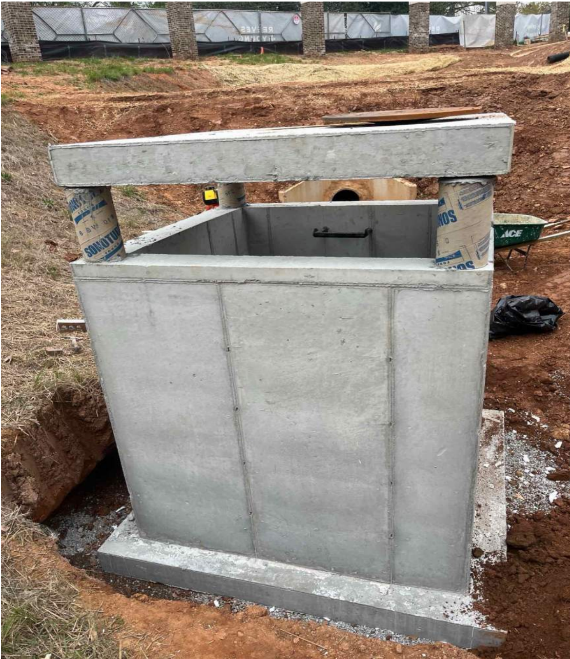
Set OCS Structure at Retention Pond