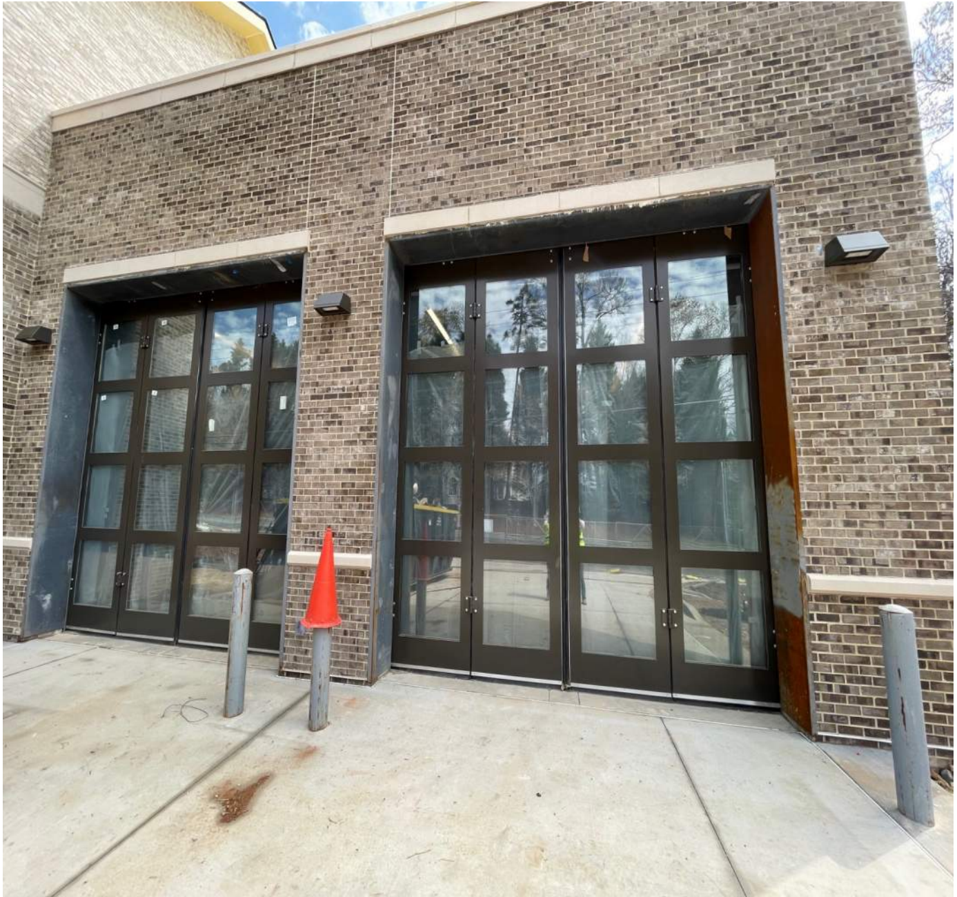
Continued Prep for Bi-Fold Door Start-up at Apparatus Bay