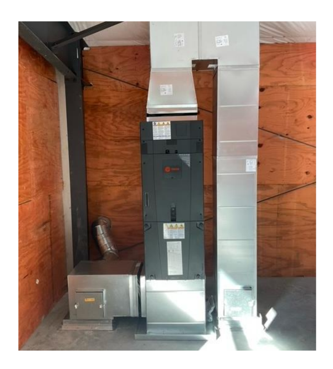
Air Handler Installed