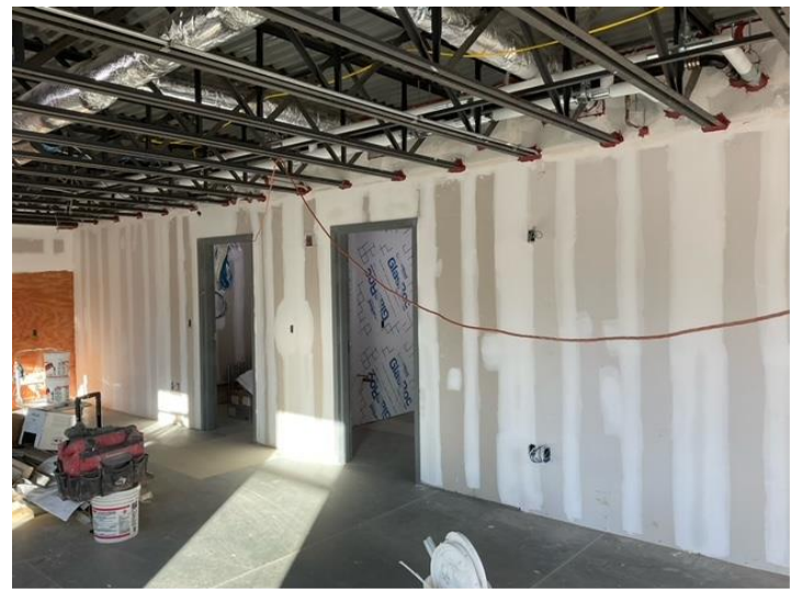
Began Drywall Finishing