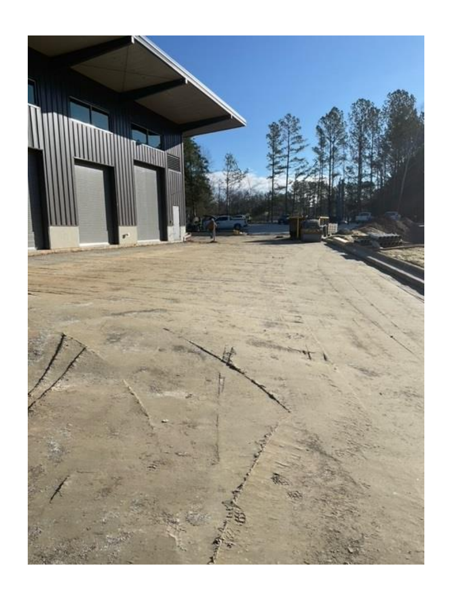
GAB Compacted - Prepping For Concrete Pour