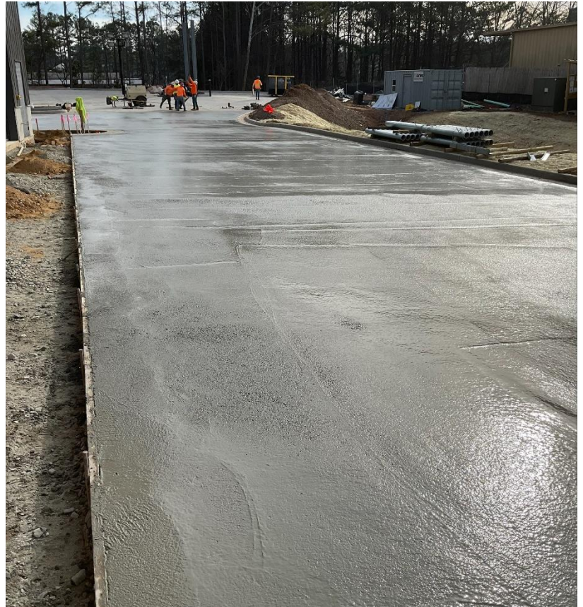
Second Portion Of Drive Poured