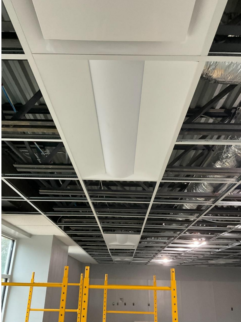
Light Fixtures Hung