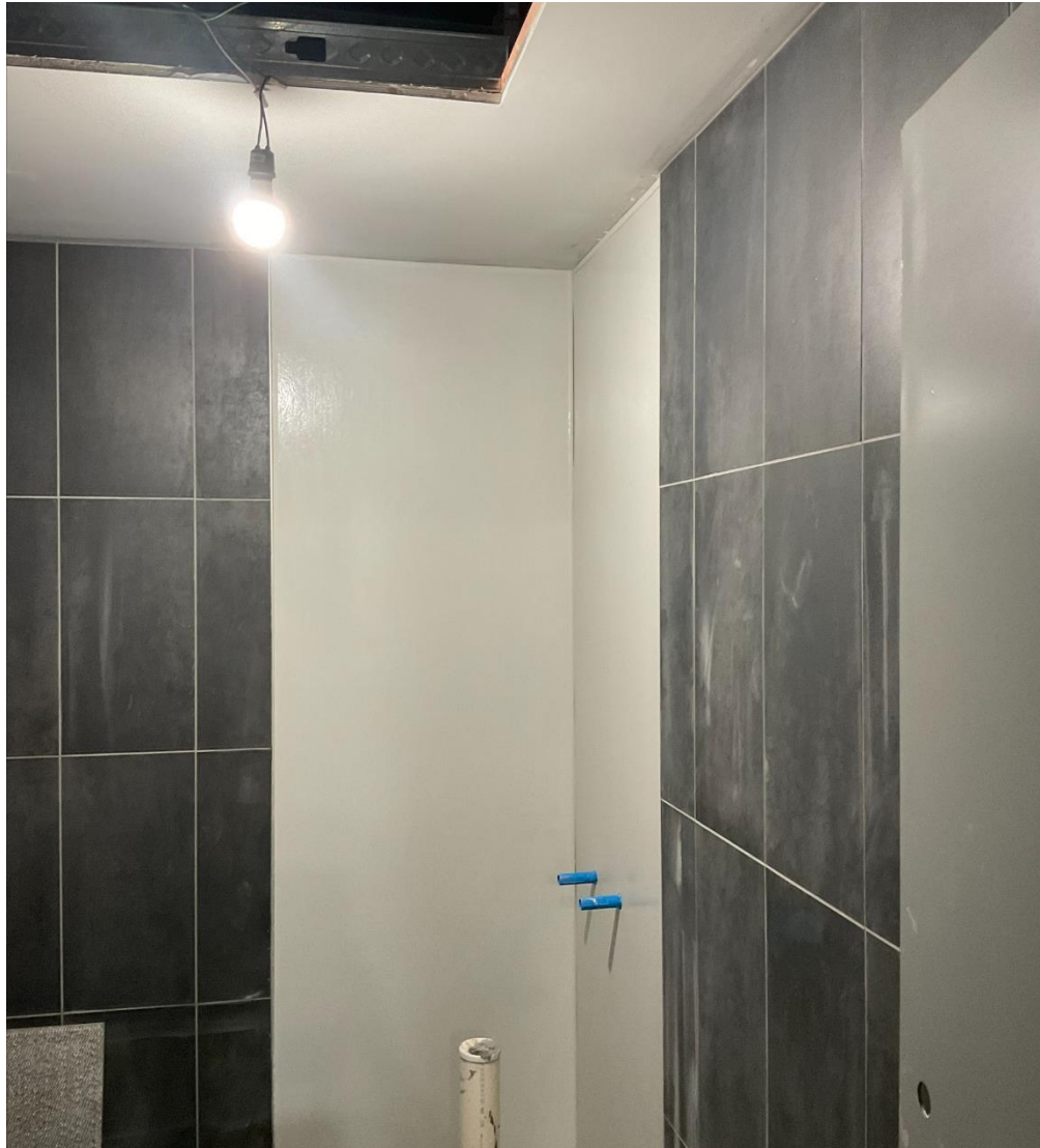
Wall Tile and FRP Install Completed