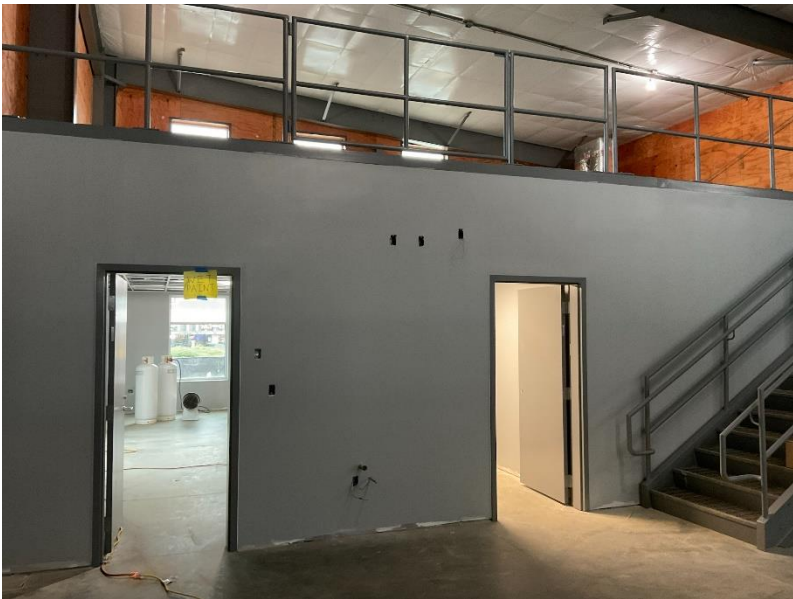
Interior walls Primed