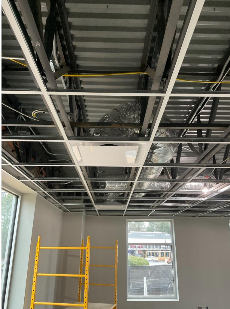
Ceiling Grid Hung