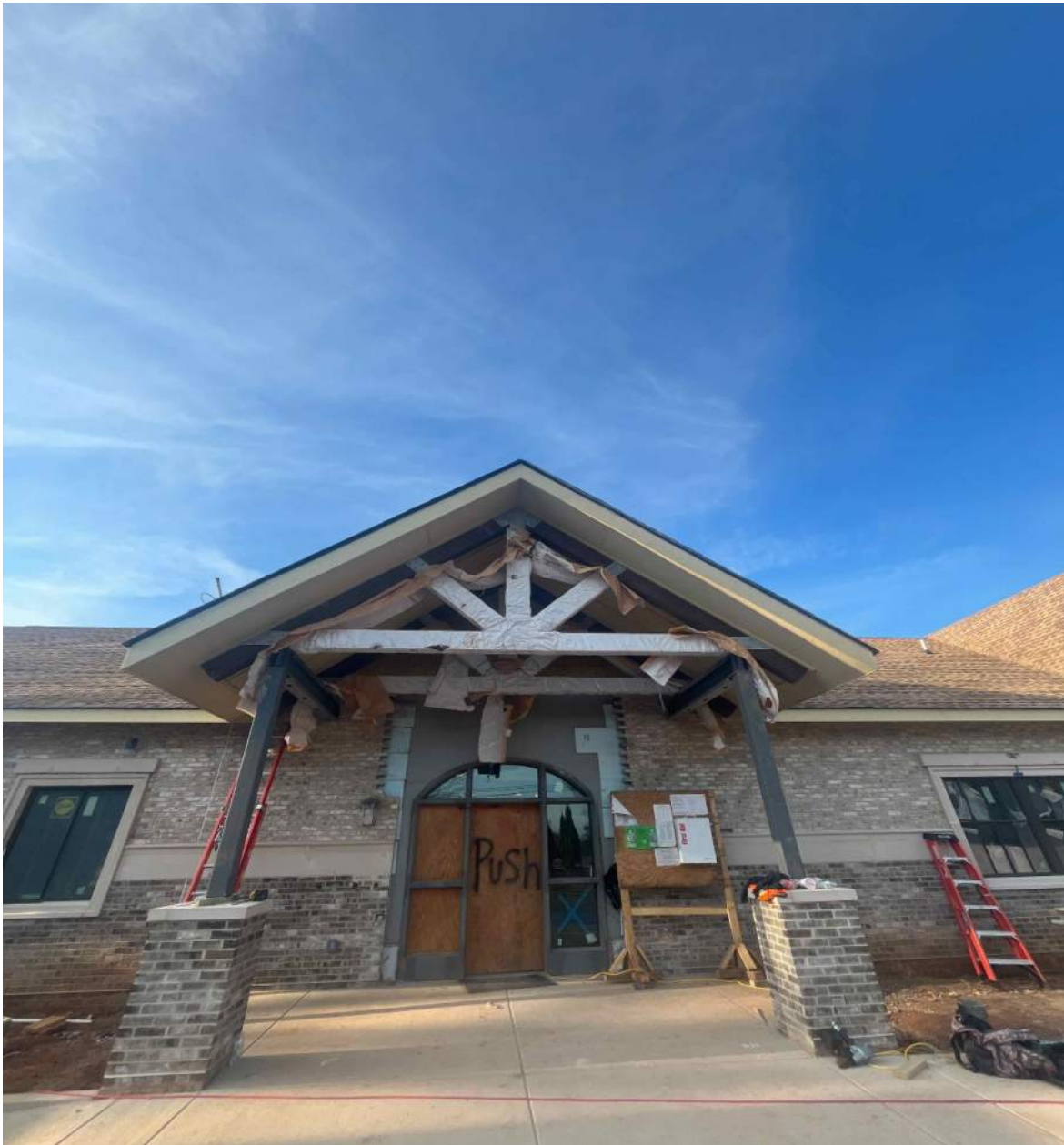
Completed Installation of Hardie Soffit at Second Floor Building Entrance