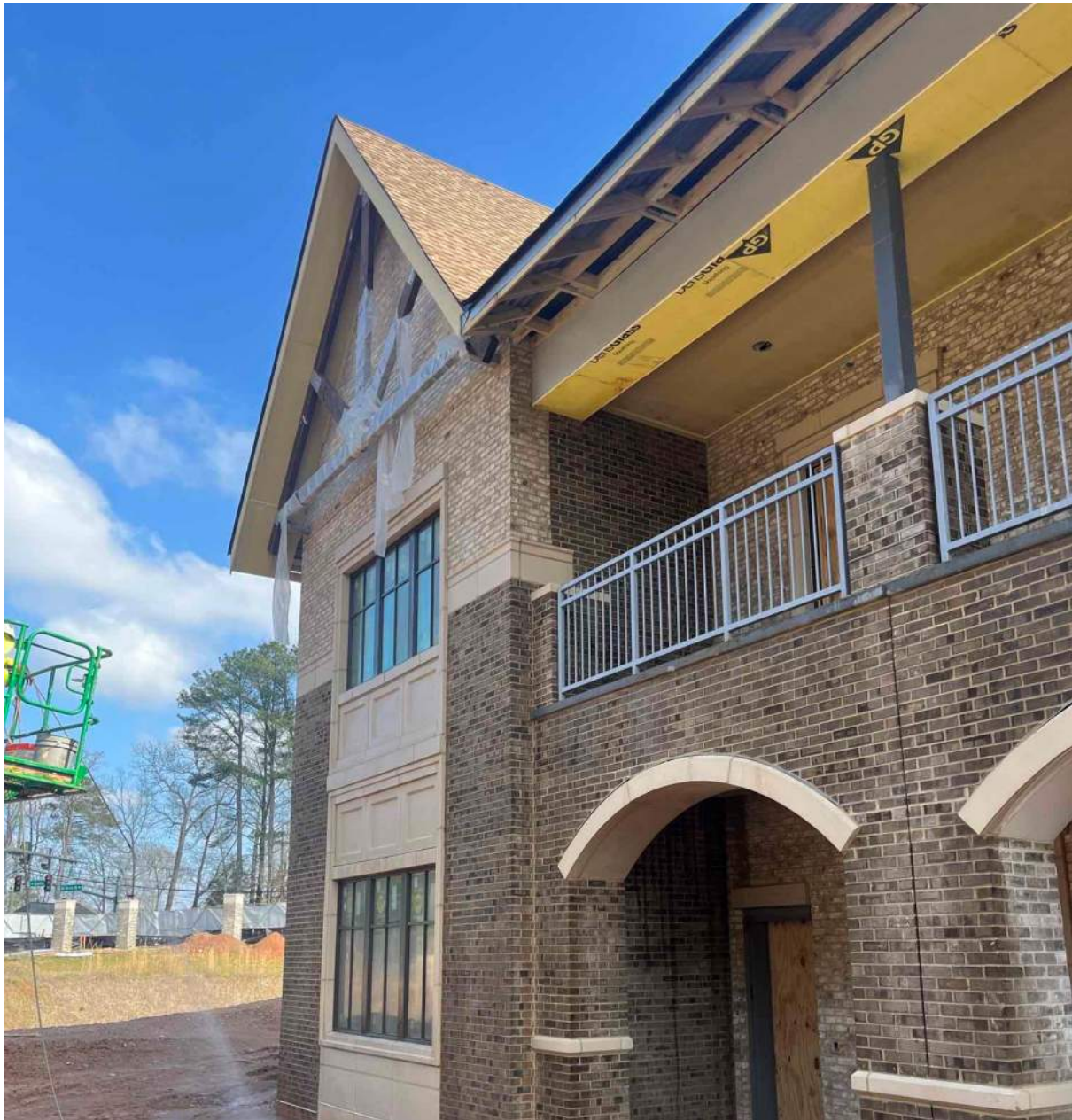
Completed Soffit Sub-Framing at Covered Porch