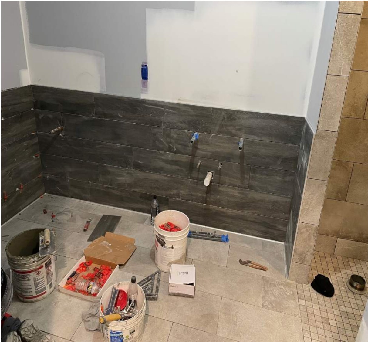
Continued Floor and Wall Tile Installation at First Floor Restrooms