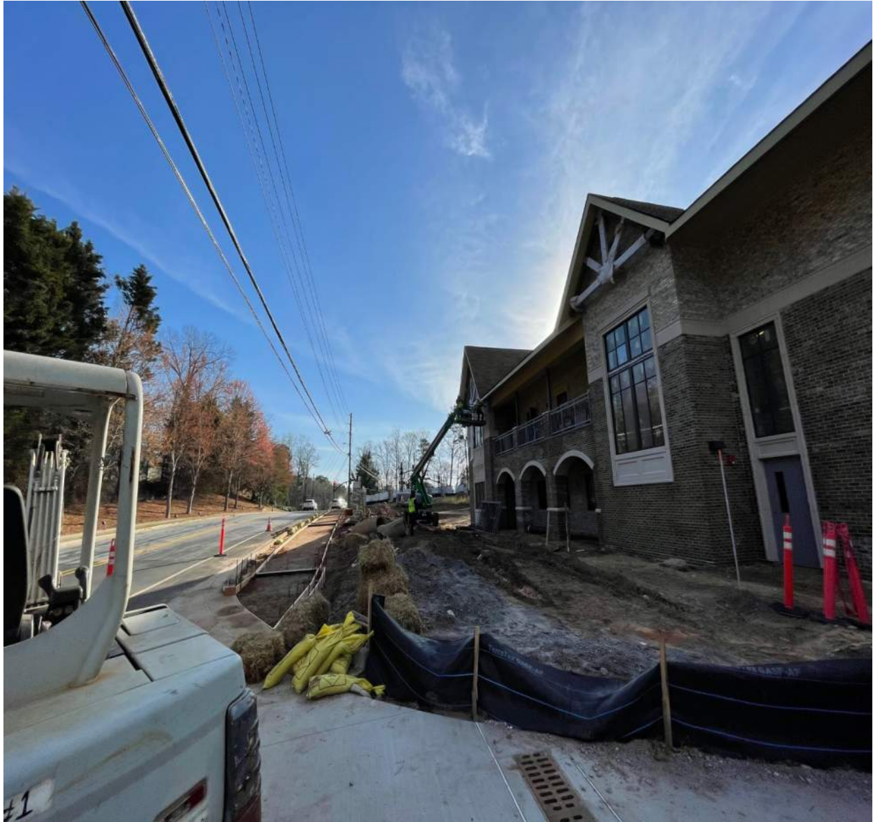
Sidewalk Formwork Prep for Concrete Pour This Afternoon