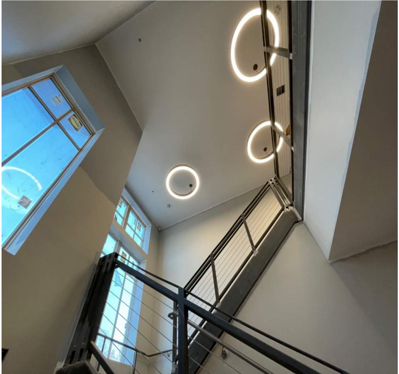
Installation of First Coat and Light Fixtures at Stairwell