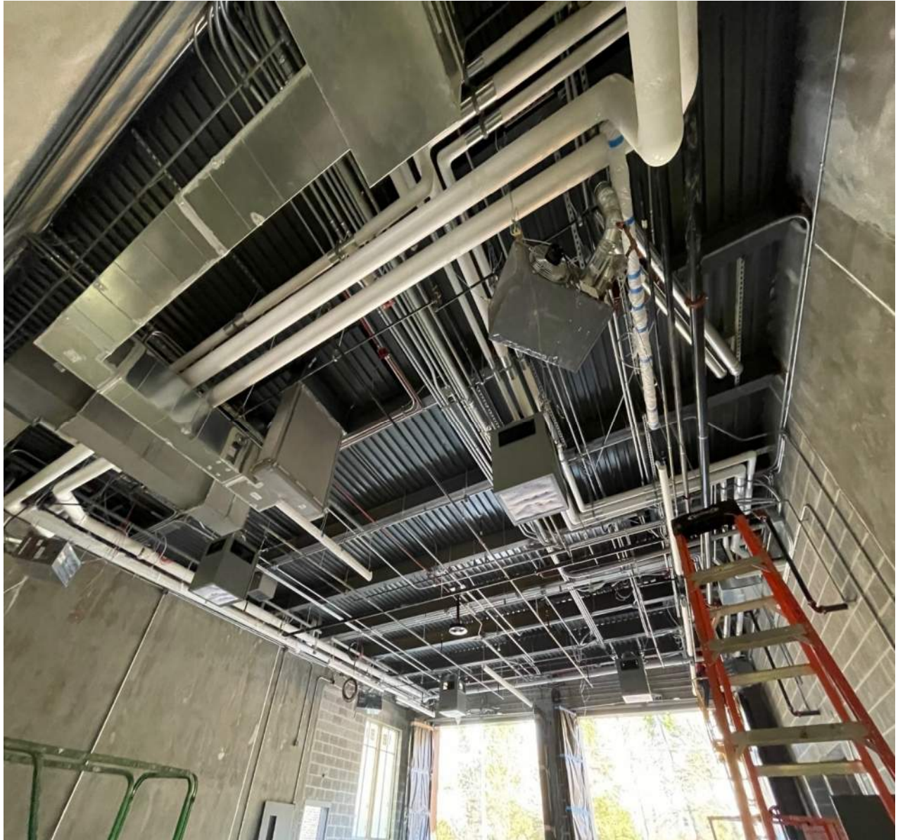
Continued Overhead Electrical at the Apparatus Bay