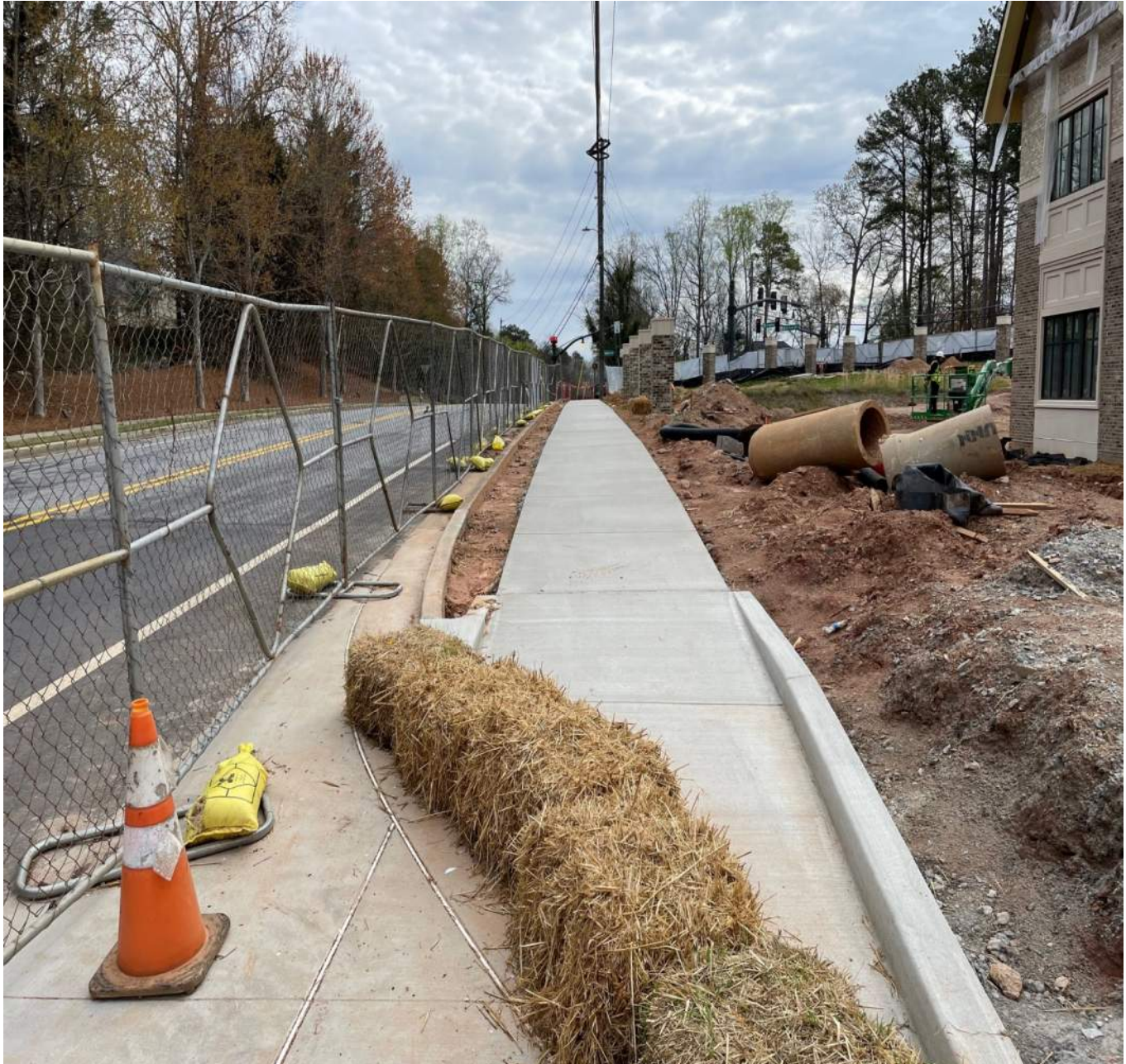
Completed Installation of Sidewalk at Spalding Drive