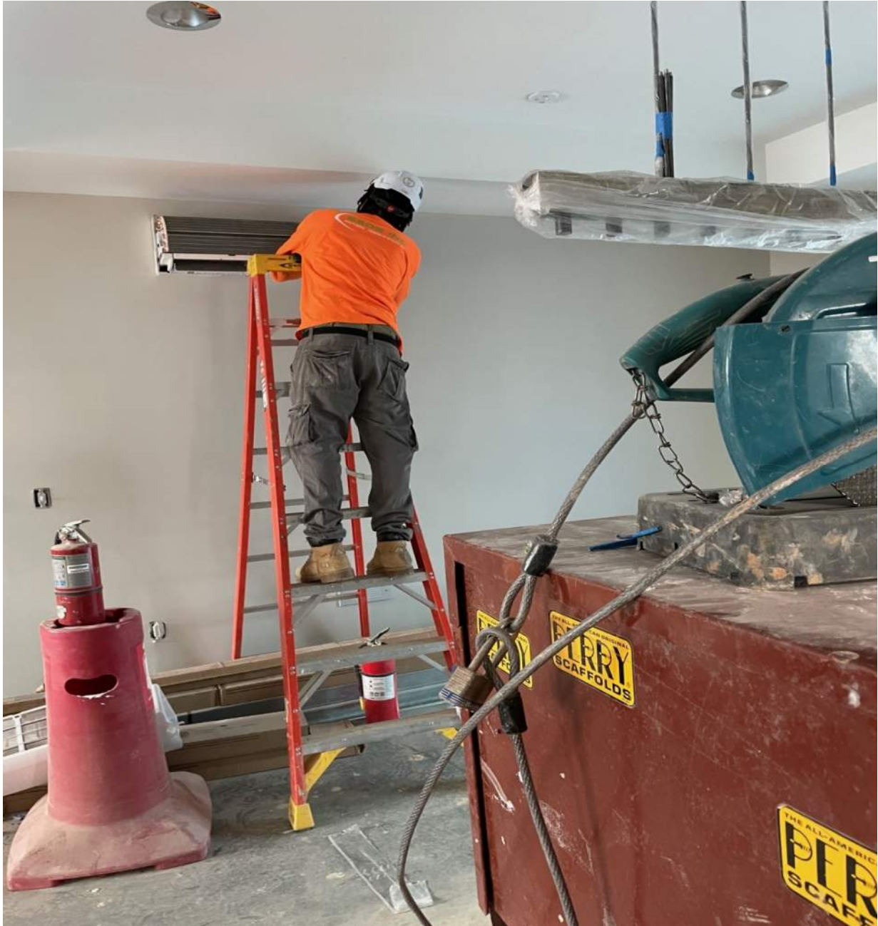
Continued Wiring for Mini-Split Units at the Second Level