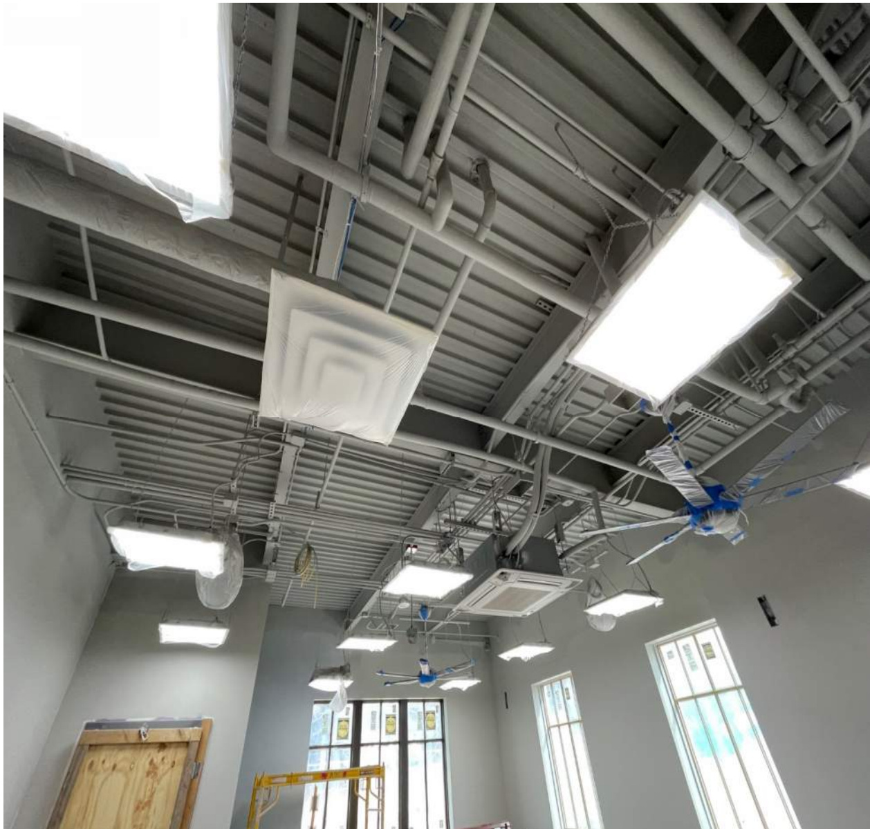
Continued Overhead Paint and Device Wiring at the First Floor Gym