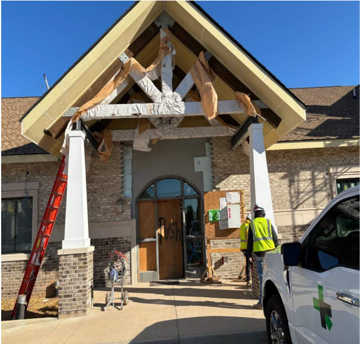
Installation of Fiberglass Column Wraps a Second Floor Main Entrance