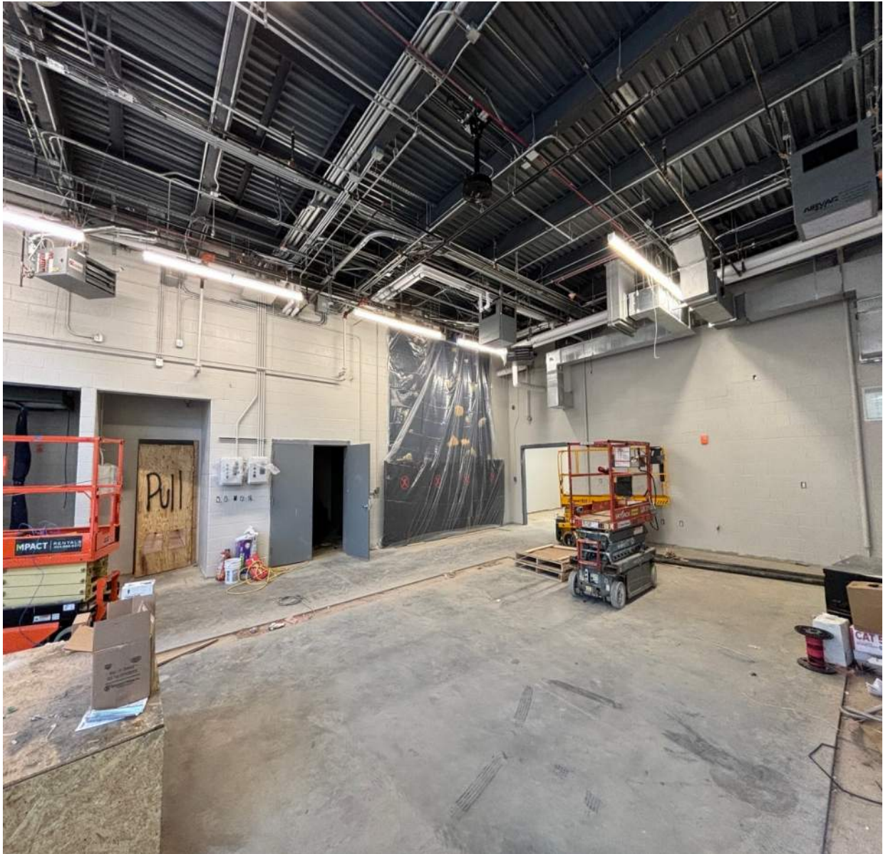
Installation of Apparatus Bay Paint and Climbing Wall