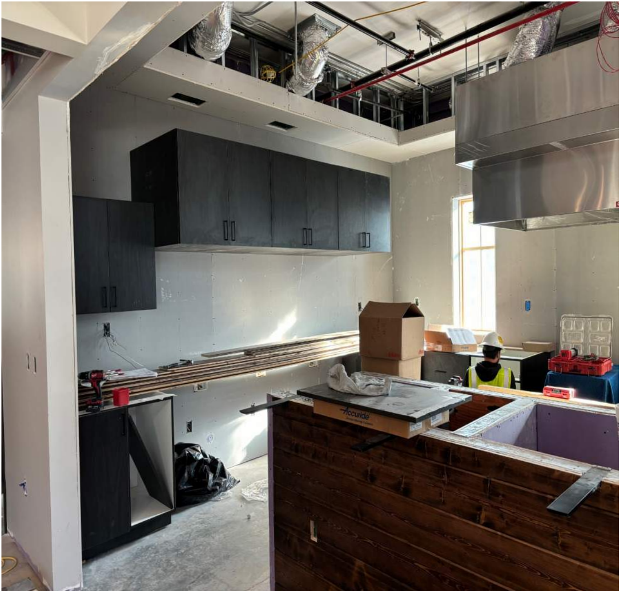
Installation of Millwork at Kitchen