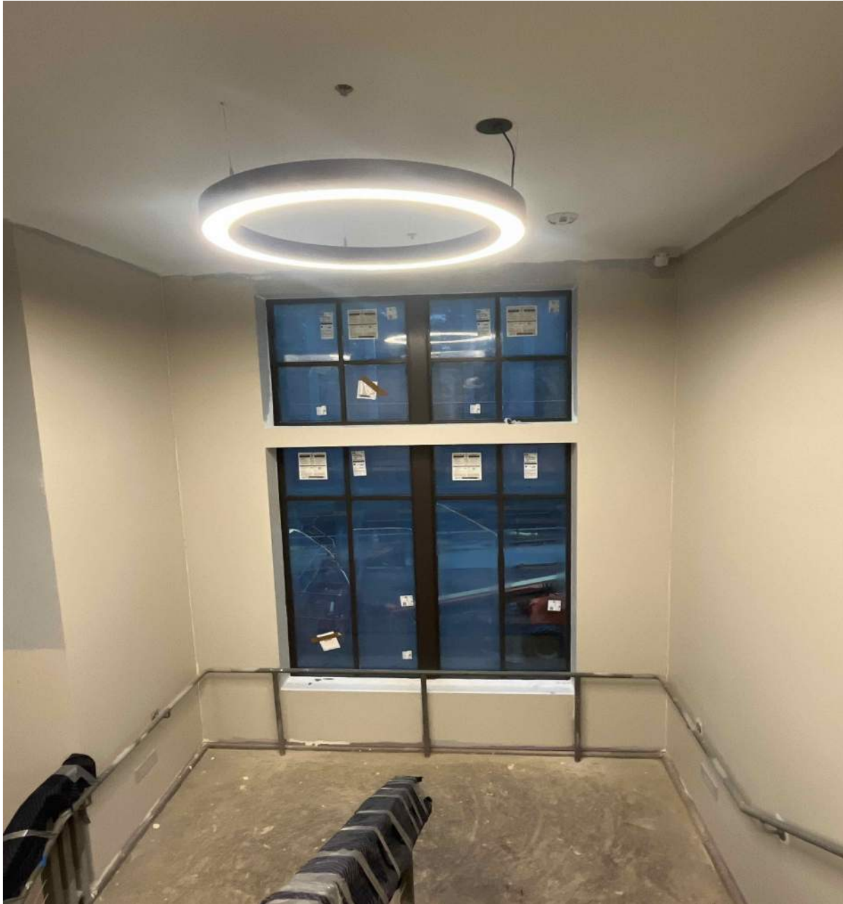
Installation of Interior Paint at Stairwell Windows