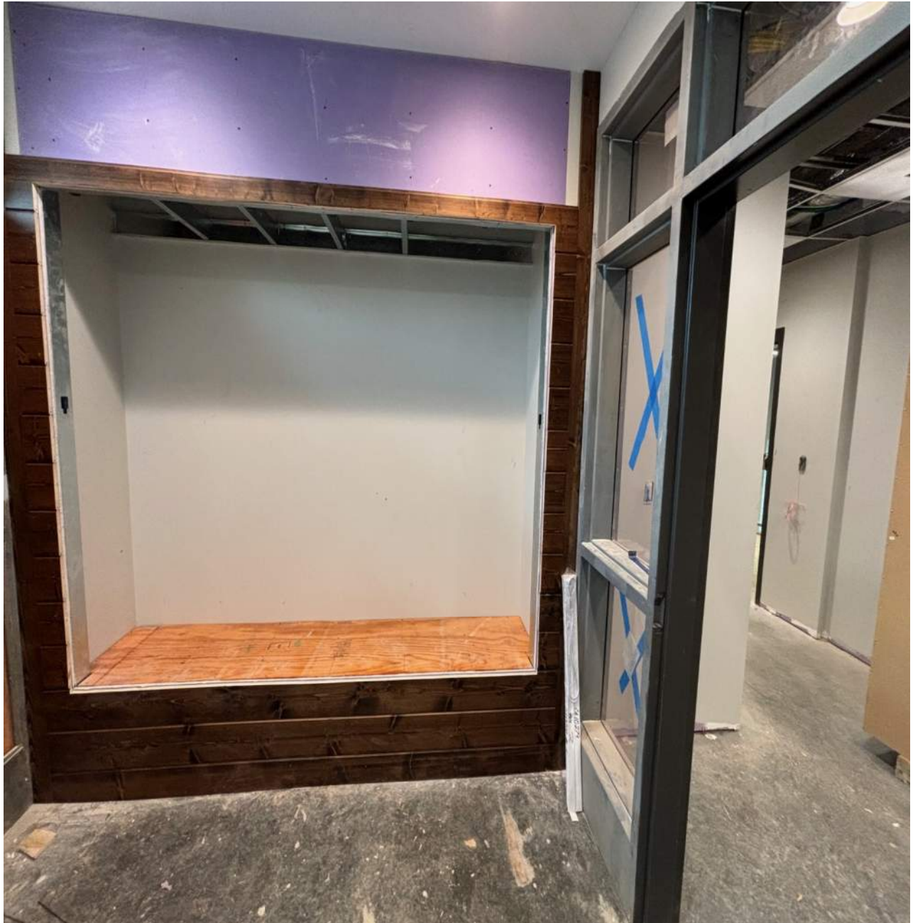
Installation of Shiplap in Prep for Display Case Installation