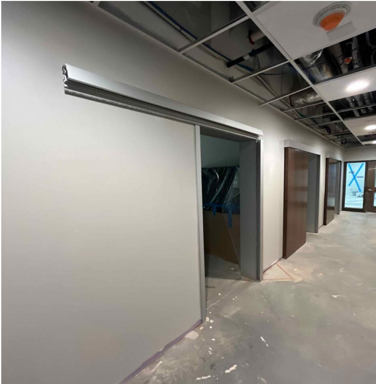
Installation of Interior Wood Barn Doors and Hardware at the First Floor Dorms