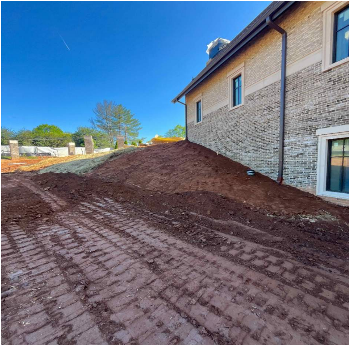
Grading in Prep for Landscaping Installation