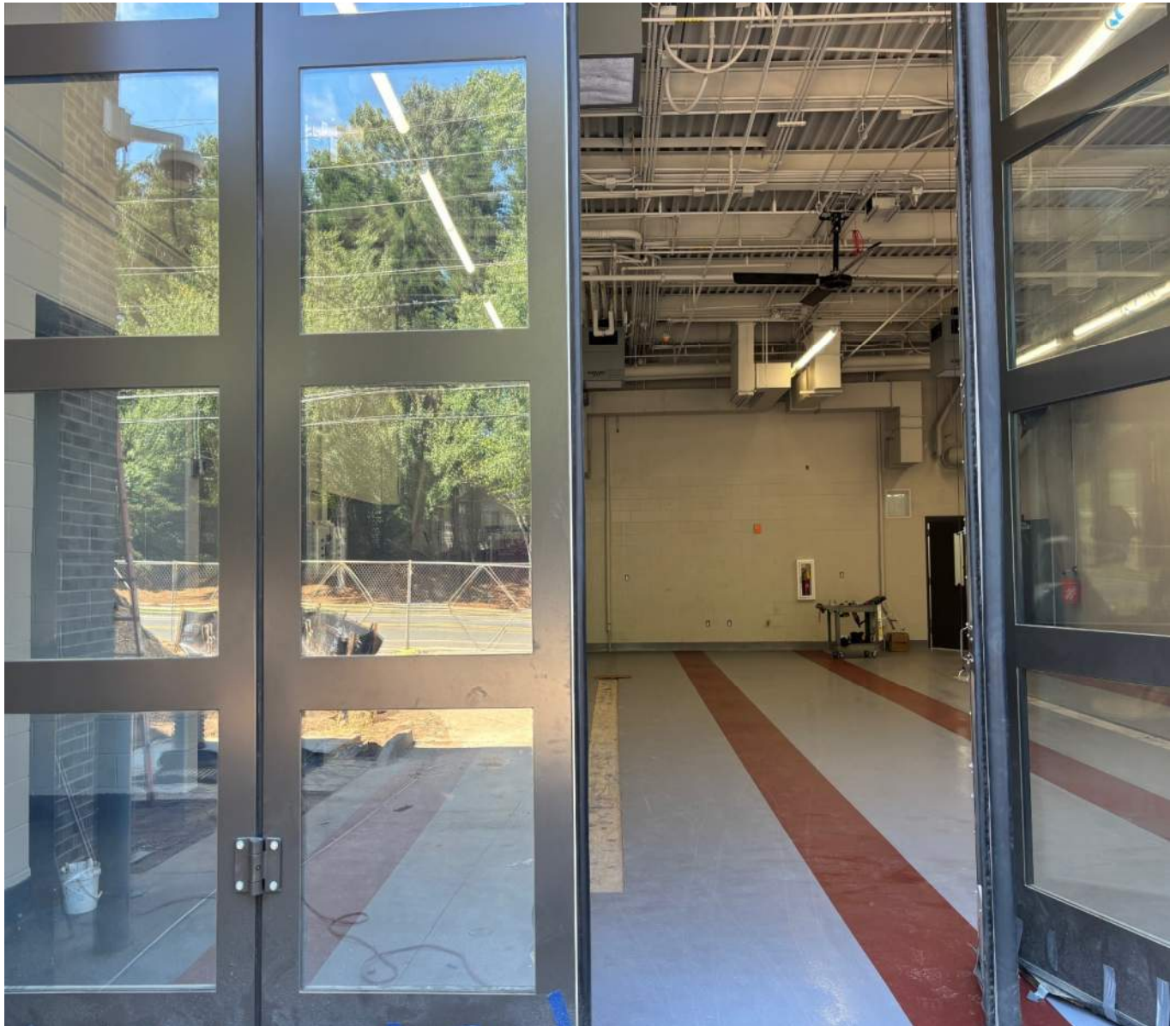
Installation of Apparatus Bay Epoxy Flooring