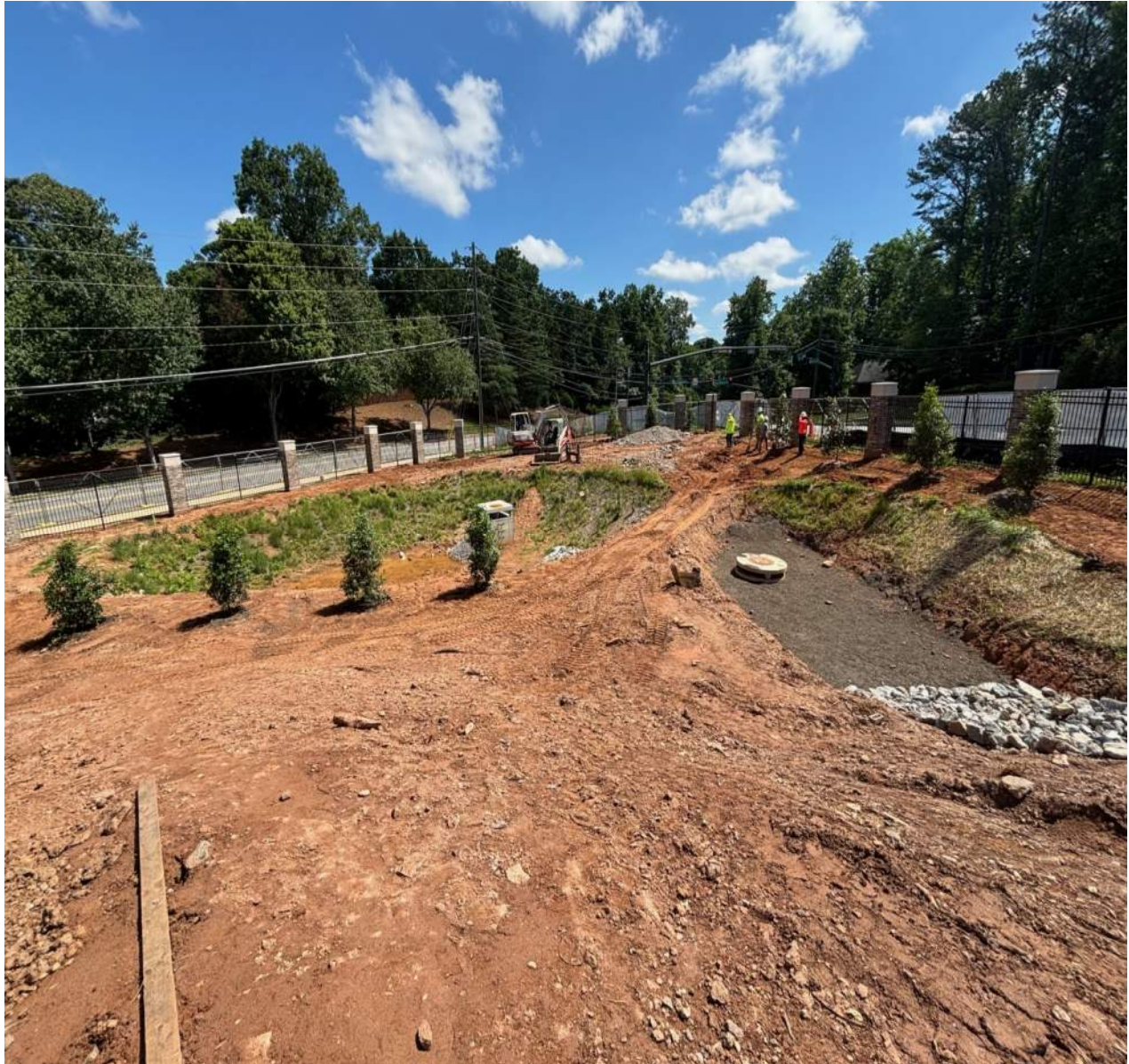
Installation of Landscaping and Site Fencing at Corner of Site