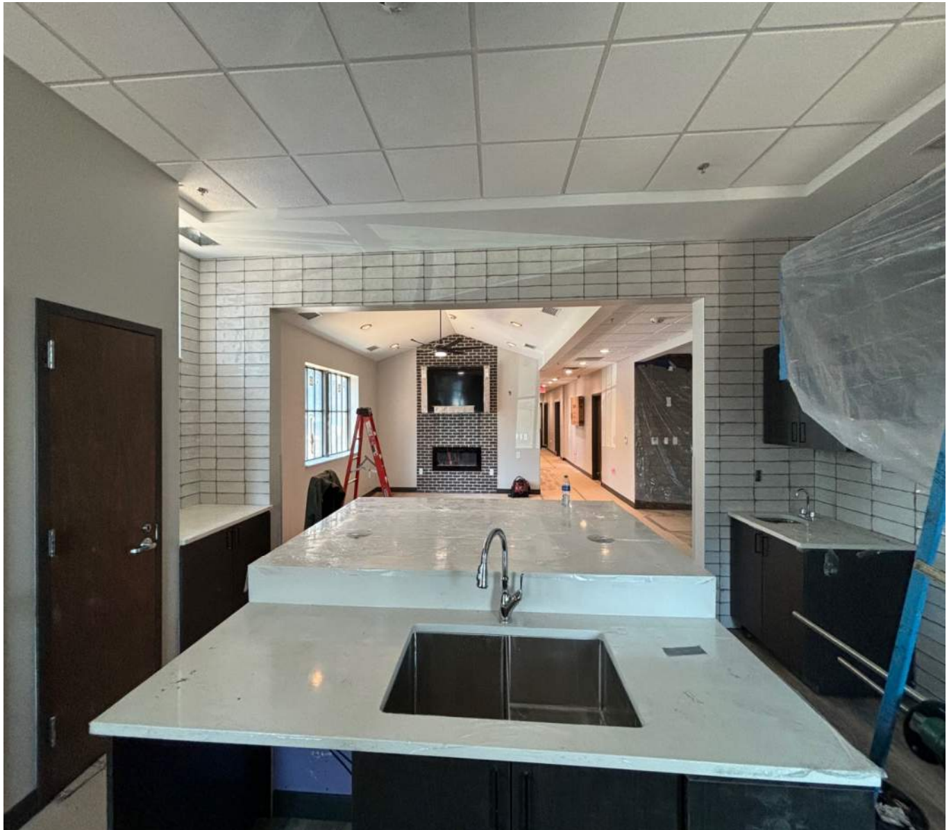
Installation of Fireplace and TV at Dayroom on the Second Floor