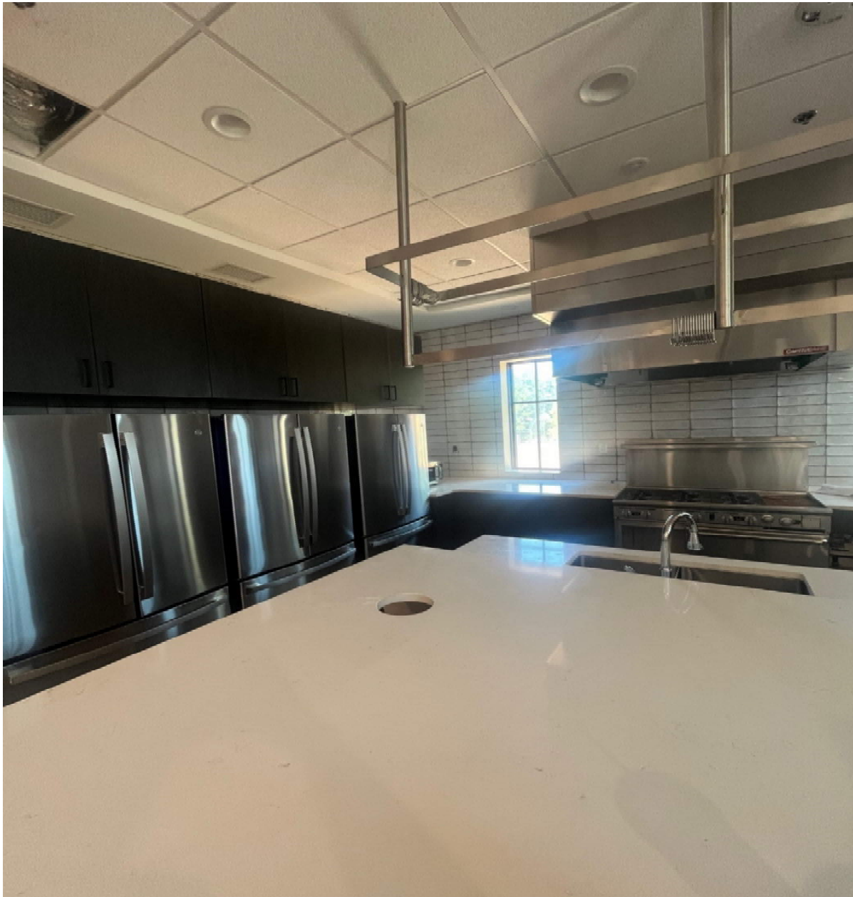
Installation of Kitchen Equipment