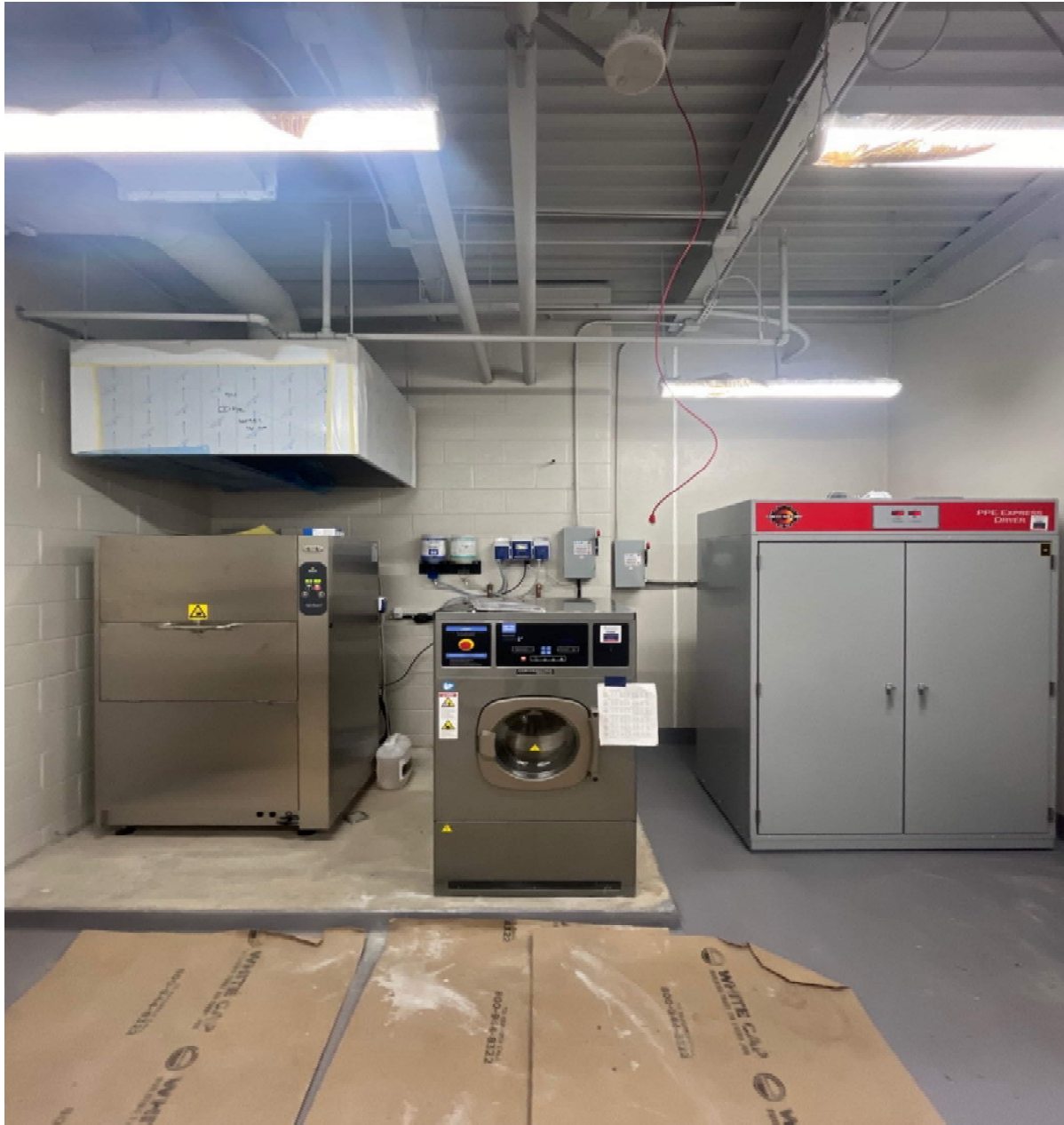
Installation of Decon Equipment