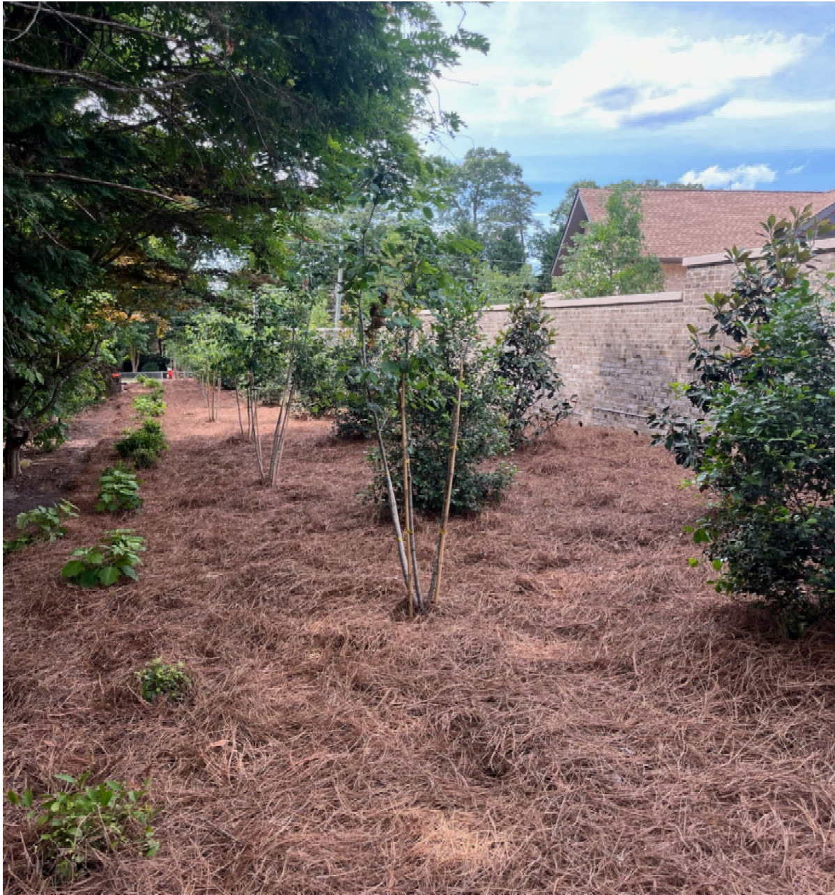
Installation of Landscaping at Site Screen Wall