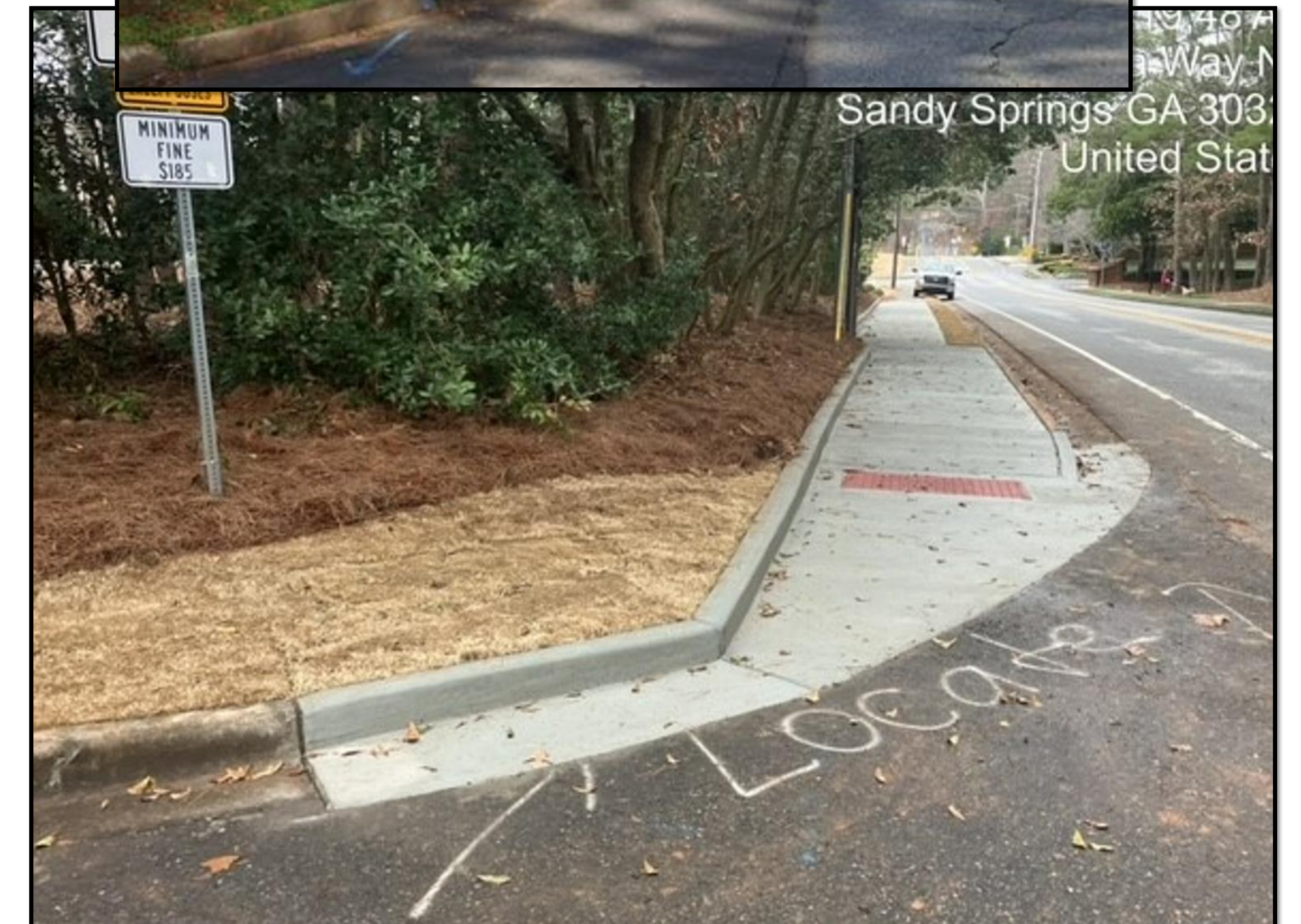
Before and after photos of Glenridge Drive Sidewalk Project at Messina Way funded by TSPLOST 2021