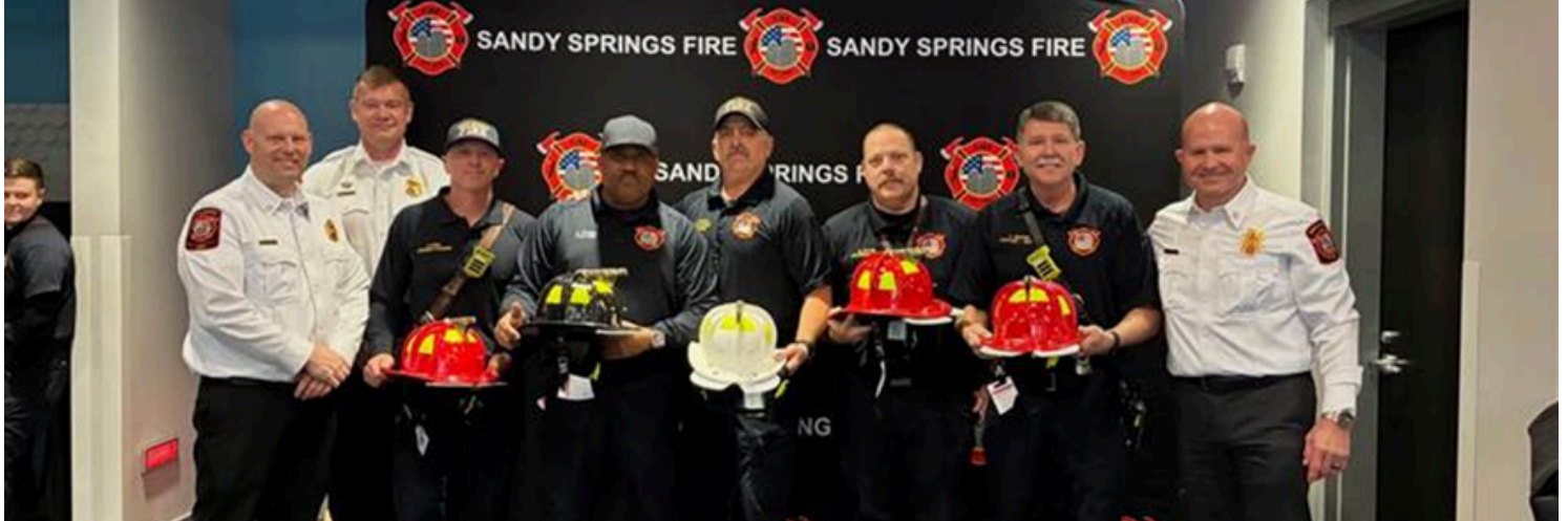
Several firefighters were recognized for their 20 years of service with leather fire helmets. Station 52 - 03/11/26