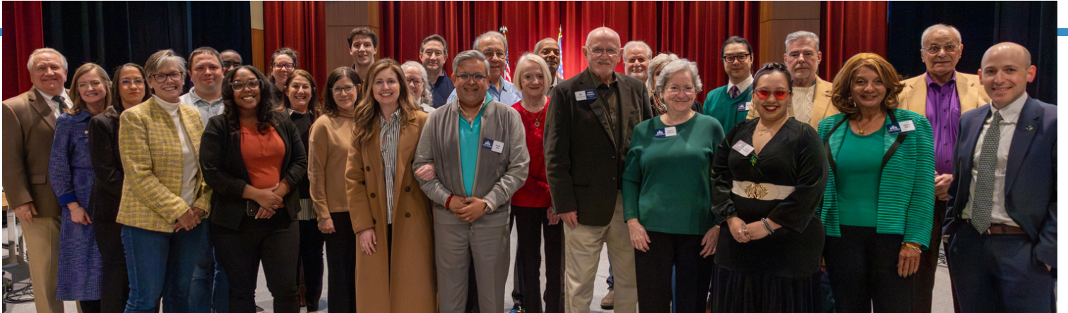
The third class of the Sandy Springs Citizens Leadership Academy gathered on March 17, 2026, to celebrate their graduation and completion of the program.